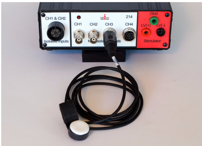
Figure HE-2-2: The PT-104 pulse plethysmograph connected to an IWX/214.