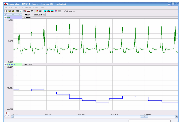
Figure HE-2-5: Pulse and heart rate from a resting subject displayed in the Analysis window.