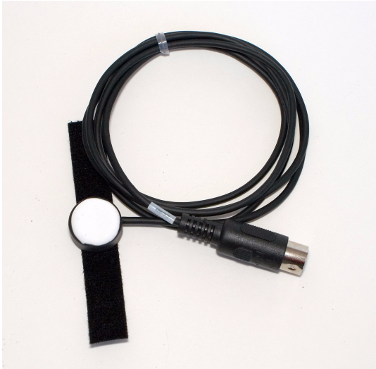
Figure HE-2-1: The PT-104 pulse plethysmograph.