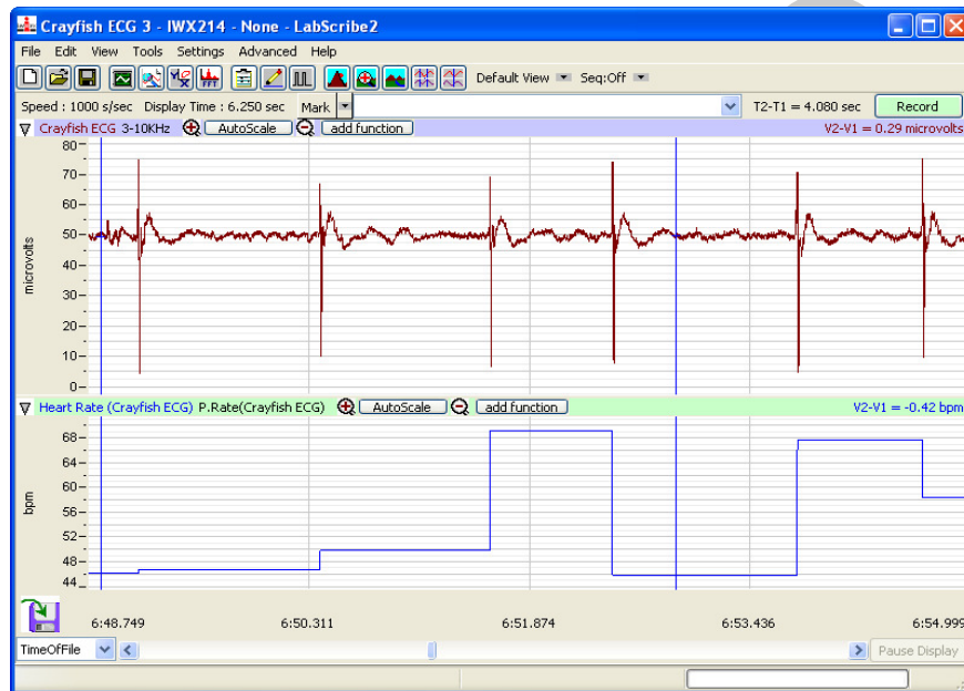
Figure AM-12-L1: Crayfish ECG and heart rate displayed on the Main Window.