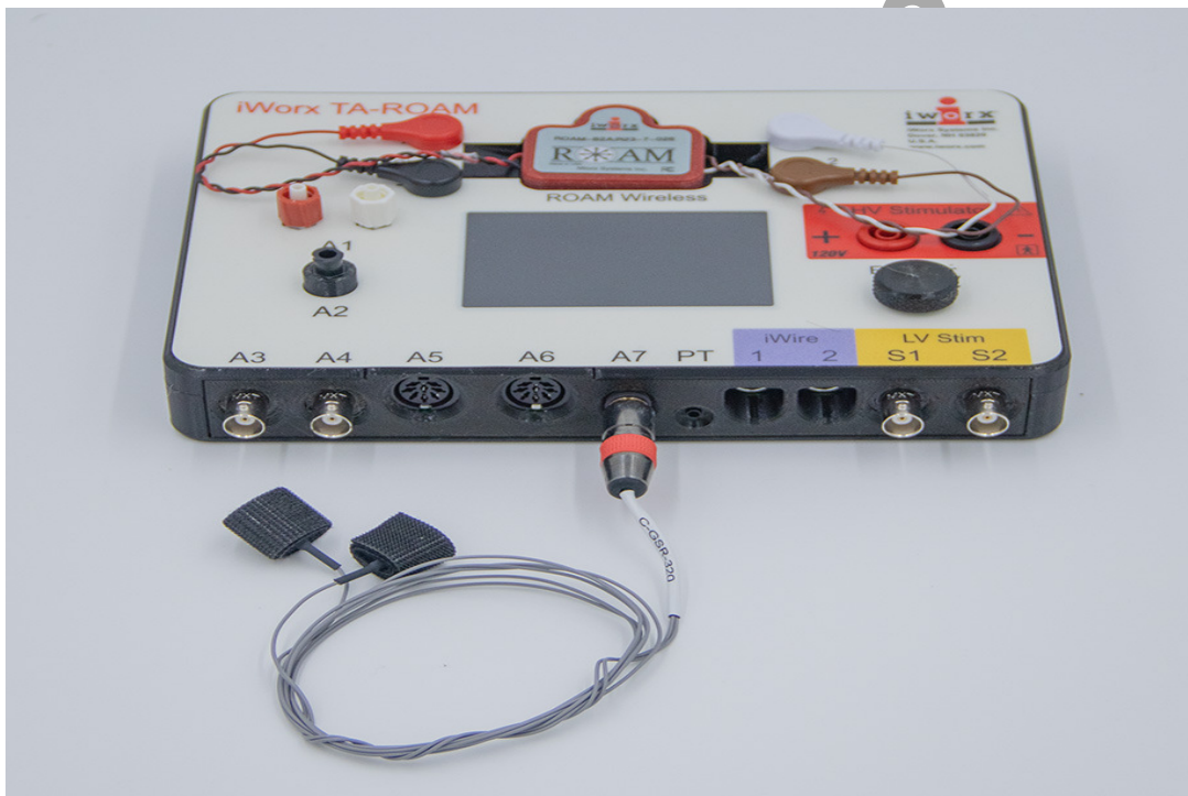
Figure HP-3-S1: The GSR galvanic skin response amplifier.