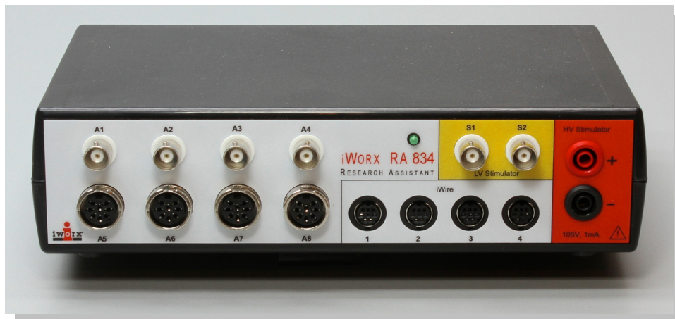
iWorx RA Recorder (IX-RA-834)