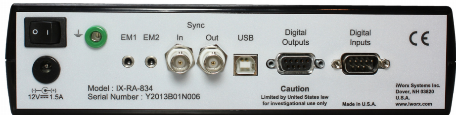
iWorx RA Recorder Rear Panel