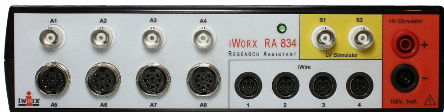
iWorx RA Recorder Front Panel

A1 through A4: BNC connectors for single-ended transducers.