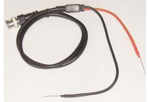
Figure 3: C-STIM-BNC-N2 stimulator cable with silver wire electrode

The C-STIM-BNC-F2 is a stimulator cable with a male-BNC connector for attachment to female-BNC outputs or adapters on stimulators. The lead wires on the other end of the C-STIM-BNC-F2 have flexible 24-gauge silver wire electrodes (80 mm long) that can be shaped to conform to the surface of tissues or organs, like the coils in Figure 4. These electrodes can be used for stimulating hearts or muscles without damaging the organs.