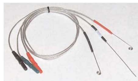
Figure 2: C-ISO-F3 lead wires with flexible silver wire electrodes