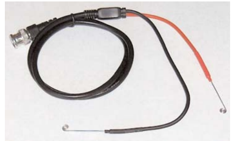
Figure 4: C-STIM-BNC-F2 stimulator cable with flexible silver wire electrode