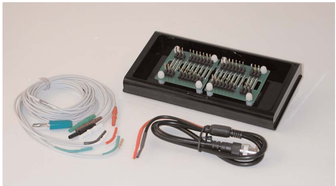
Figure 1: The NBC-402 nerve bath chamber with pin connector lead wires and stimulator cable.

The NBC-401 is ideal for recording compound action potentials in the student laboratory, from the sciatic nerve of an average-sized frog or leg nerves from invertebrates (Figure 2). The NBC-402 is ideal for recordings from the earthworm nerve chord, bullfrog sciatic nerves, or the frog nerve-muscle preparation (Figure 1).