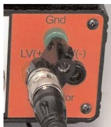
Figure 3: The analog output of an IX-214 data acquisition unit as it is configured to connect to the Common Command Input of the CK-100. The BNC cable to the CK-100 needs to be connected to the IX-214 with a Male Double Banana-Female BNC adapter.