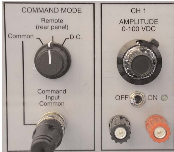
Figure 1: The command mode control knob for selecting the type of triggering used on the CK-100, and input connector for the common mode with a BNC cable attached, are seen on the left side. The output connectors and controls, the amplitude knob and the On-Off switch, are seen on the right side.