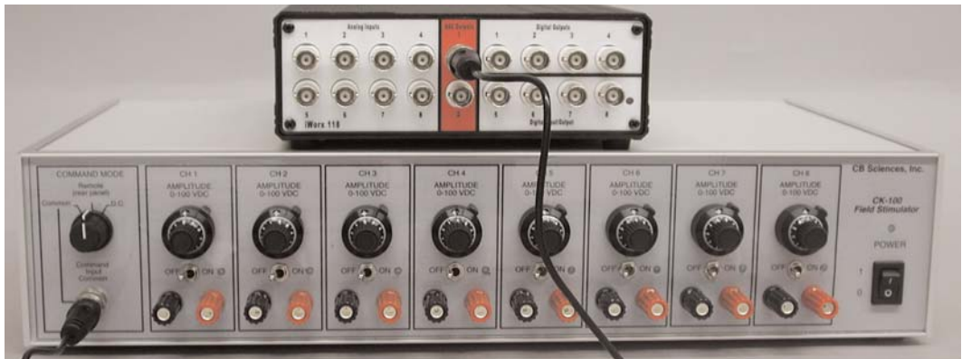
Figure 2: The analog output of an IX-118 data acquisition unit connected to the Common Command Input of the CK-100.