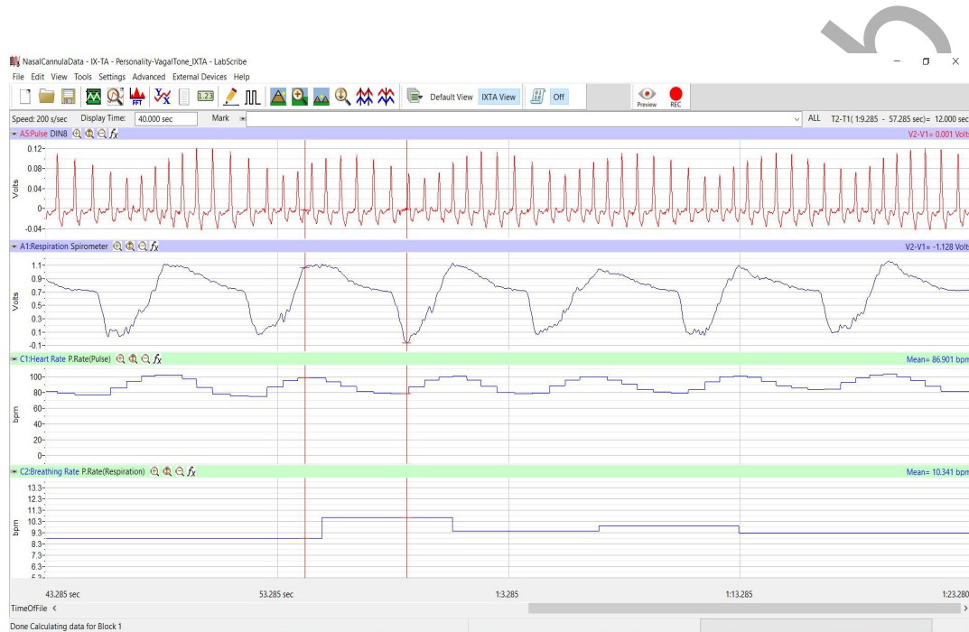
Figure HP-22-L2: Sample data showing pulse, heart rate, respiration and breathing rate.