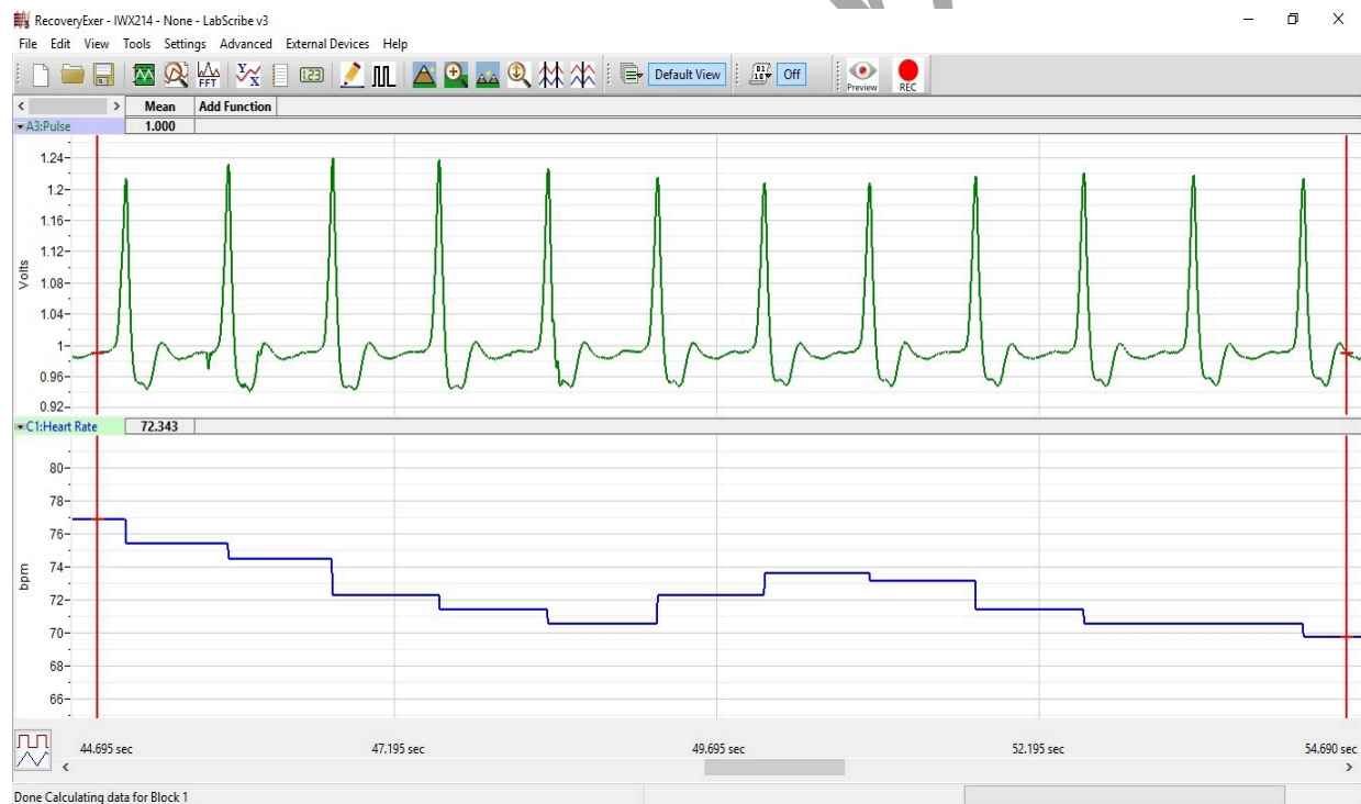
Figure HE-2-L3: Pulse and heart rate from a resting subject displayed in the Analysis window.