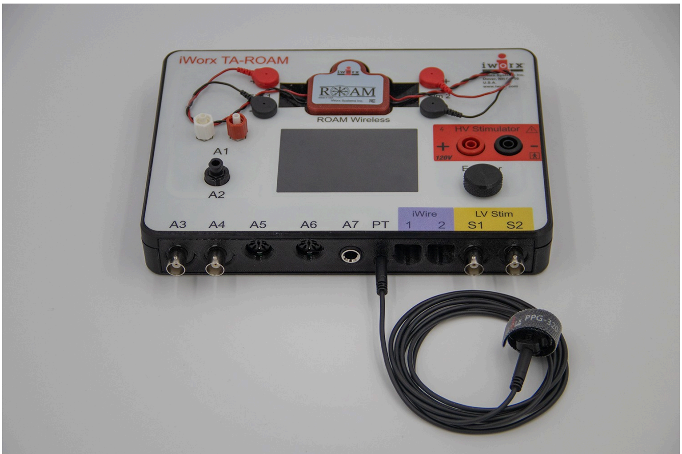
Figure HE-2-S1: The PPG-320 pulse plethysmograph connected to the TA.